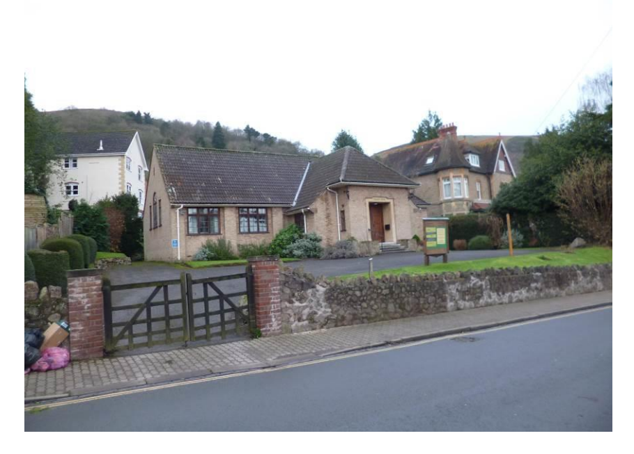
Fig.4: the setting of the meeting house

There is a detached burial ground at Darby Road in Ironbridge, still in use and managed by the Coalbrookdale Trust (NGR SJ6656904977). This is grade II listed; list entry 1206383. Friends in Malvern look after a Peace Garden at Malvern Cube on Albert Road. Originally designed by Matthew Jackman in 2010 for a garden show, the contemplative garden is laid out to reflect the Quaker tenets of peace, truth, simplicity and equality and is now also used for growing vegetables.